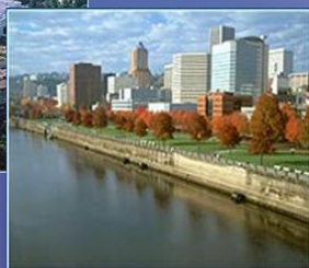
Oregon Health Science University Hospital and Downtown Portland, OR

OHSU Hospital is the largest teaching hospital and trauma center in the state of Oregon. This gives our nurses the opportunity to learn cutting edge treatment modalities within an academic setting, where new knowledge is acquired every day. Top pay for qualified RN's who are ready to hit the ground running in areas such as OR and Trauma ICU. Portland is the largest city in OR and is known for its lush green scenery which includes beautiful Mt. Hood. Portland has an extensive public transportation system including light rail making it unnecessary for a car. The outdoor enthusiast will love the Portland area with its extensive network of bike/hiking trails within the city limits. The rugged Oregon coast is just over a 40 minute drive and provides some of the most breathtaking scenery in the world.