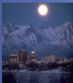
Alaska Psychiatric Institute & Downtown Anchorage, AK

Alaska Psychiatric Institute, the state's largest psychiatric facility is seeking psychiatric nurses to work various shifts in Anchorage. Contact your SHC recruiter to discuss this opportunity in more detail. Anchorage the state's largest city provides a plethora of winter activities including downhill and cross country skiing, hiking, and observing the Northern Lights. Anchorage awaits our adventurous traveler who is ready for a unique experience in the country's largest state.