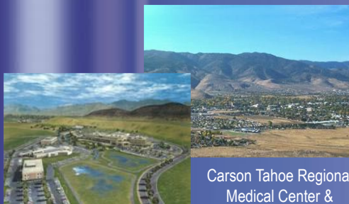
Carson Tahoe Regional Medical Center & Mountainous View in Carson City, NV

OHSU Hospital is the largest teaching hospital and trauma center in the state of Oregon. This gives our nurses the opportunity to learn cutting edge treatment modalities within an academic setting, where new knowledge is acquired every day. Top pay for qualified RN's who are ready to hit the ground running in areas such as OR and Trauma ICU. Portland is the largest city in OR and is known for its lush green scenery which includes beautiful Mt. Hood. Portland has an extensive public transportation system including light rail making it unnecessary for a car. The outdoor enthusiast will love the Portland area with its extensive network of bike/hiking trails within the city limits. The rugged Oregon coast is just over a 40 minute drive and provides some of the most breathtaking scenery in the world.