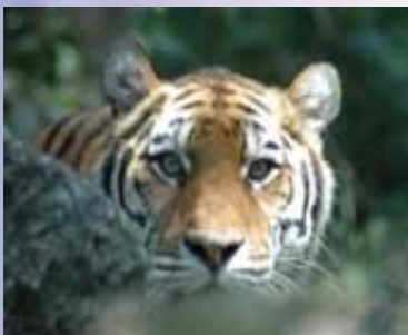
Cheyenne Mountain Zoo-Colorado Springs, Colorado

ASIAN HIGHLANDS - Experience the exotic and endangered Amur tigers, Amur leopards and Pallas cats roaming the side of our mountain in natural habitats!